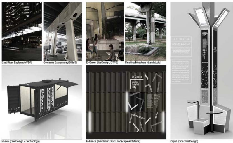
El-Space: BQE Analysis