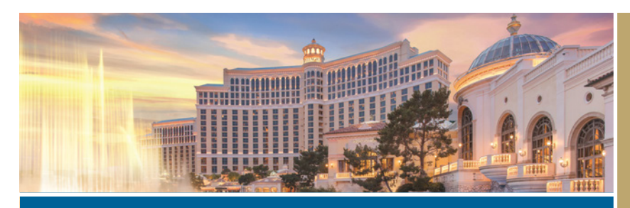
LOCATION The Bellagio | 3600 S Las Vegas Blvd | Las Vegas, NV 89109